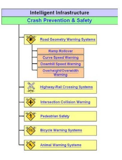
Chart indicating pedestrian and bicycle safety applications within the USDOT ITS program.

<ITS> Bicycle warning systems can use detectors and electronic warning signs to identify bicycle traffic and notify drivers when a cyclist is in an upcoming segment of roadway to improve safety on narrow bridges and tunnels.