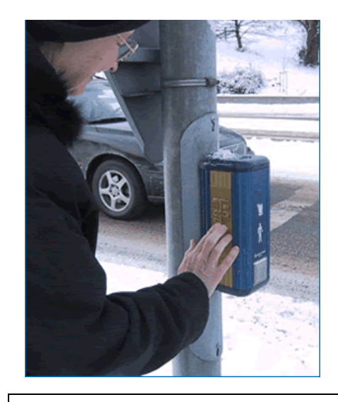
A woman in Sweden uses a tactile map on the side of this APS device to find out what to expect as she crosses the intersection.

Pedhead-mounted Pushbutton-integrated Vibrotactile-only Receiver-based