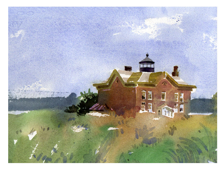
"Saugerties Lighthouse" by Staats Fasoldt, Rosendale. The Saugerties Lighthouse was listed on the National Register of Historic Places in 1978.