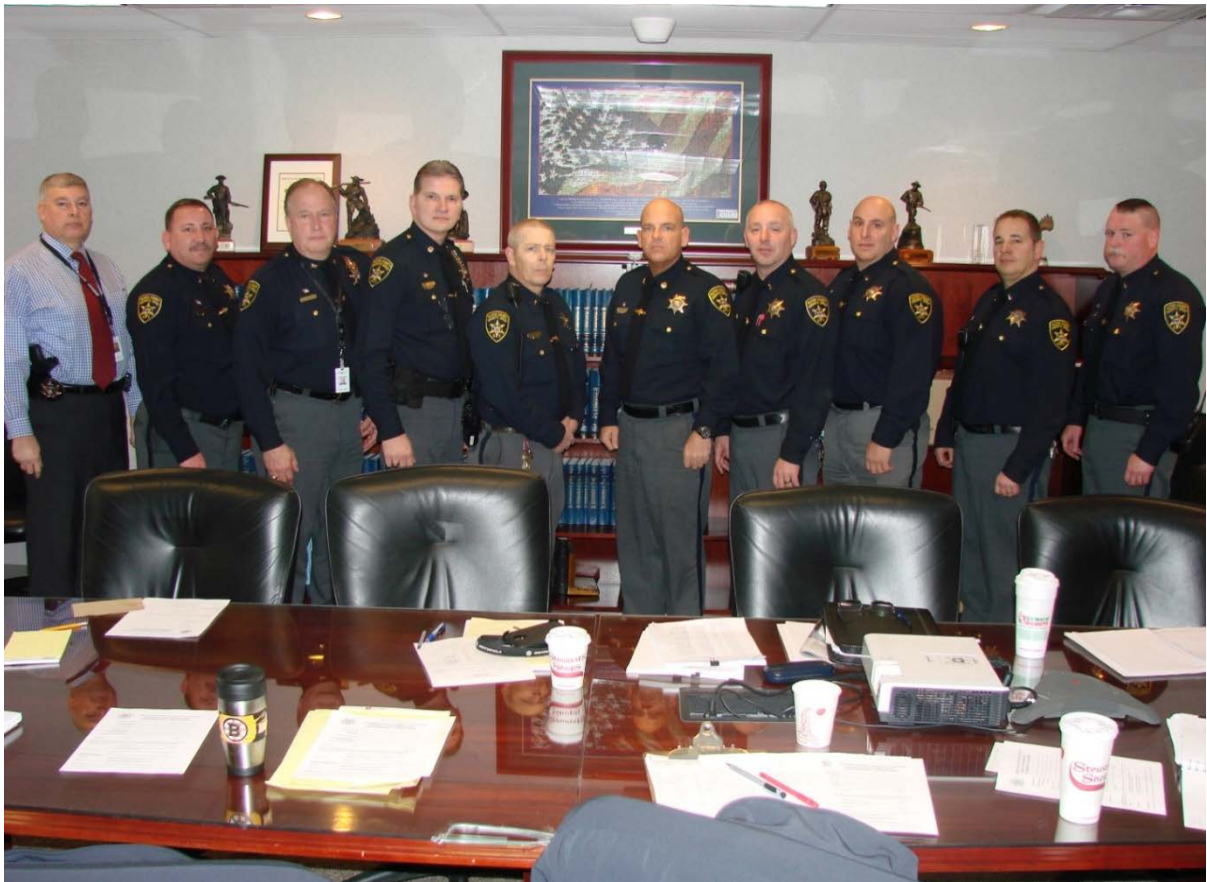
Corrections Command Staff

Committed to the jail are prisoners that may be charged with any type of crime or violation, including homicide, sex crimes, DWI, trespassing, etc. In order to provide a safe and secure correctional institution for these inmates, the Sheriff's Office employs both full and part-time correction personnel. These positions consist of correction officers, 11 corporals, 8 sergeants, 6 lieutenants, 2 wardens and a superintendent.