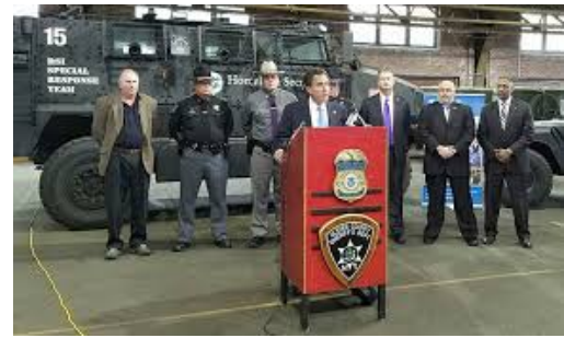
United States Attorney Richard Hartunian addresses reporters at a press conference following the arrests of 10/13/16

Operation Blood Klot: Beginning in late 2014, URGENT, the United States Department of Homeland Security and New York State Police Special Investigations Unit began an investigation into the ongoing large scale distribution of heroin and cocaine in the Kingston and Poughkeepsie areas. Numerous purchases of cocaine, heroin, diverted pharmaceuticals and firearms were purchased from numerous people in both regions. Later, a “wire tap” was conducted on several of the targets’ communications devices, which led to additional incriminating evidence. On 10/13/16, approximately 45 defendants in Ulster and Dutchess Counties were arrested in early morning raids of their residences. An additional six firearms, one half kilogram of cocaine and approximately $160,000 in cash were seized that morning. These prosecutions are currently pending in the United States District Court, Northern District of New York.