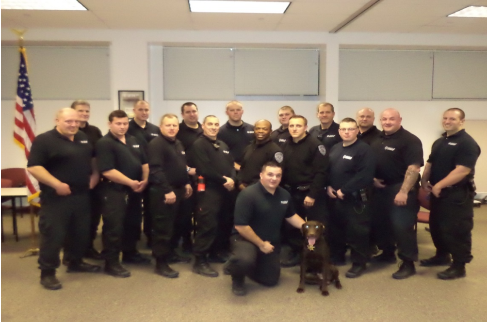
Sheriff's Emergency Response Team

1,100 hours of training. This training consisted of physical training in the weight room, chemical agents, cell extraction, cell searches, jail shake-downs, Article 35/Use of Force, hostage survival, and firefighting and firearms certification. The Corrections Division and the Patrol Division continue to be joined together forming a larger and stronger S.E.R.T. team.