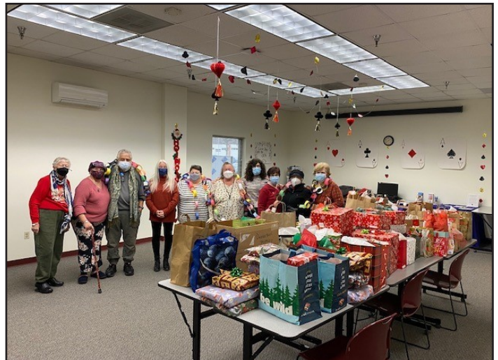
Ulster County Office for the Aging Holiday Luncheon, Saugerties Senior Center.