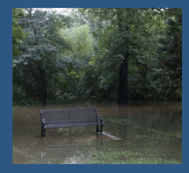
Here, a flood prone home was acquired and the property was converted to parkland. During the next storm, the residents were safe in their new home on higher ground, and no damages were incurred on this parcel.

Natural disasters cannot be prevented from occurring but, if we tackle some of the biggest risks with hazard mitigation projects, eventually, our hazards won't become disasters.