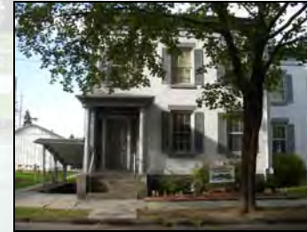
UC Department of the Environment 17 Pearl Street