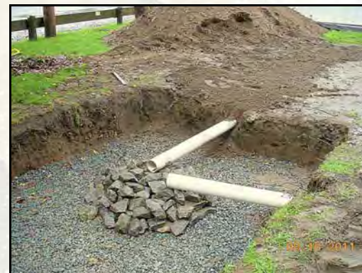
Drain pipes coming from roof, entering garden area

Rainwater is directed into the garden from residential roof drains, driveways, and other hard surfaces. Rain gardens slowly release runoff into the ground rather than allowing it to flow into the stormwater system. The runoff temporarily ponds in the garden and seeps into the soil over a day or two. The system consists of an inflow component, a shallow ponding area over a planted soil bed, mulch layer, gravel filter chamber, attractive shrubs, grasses, and flowers, and an overflow mechanism to convey larger rain events to the storm drain system.